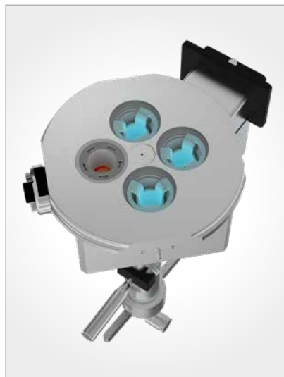
Preparation of Dosimetry and cell culture