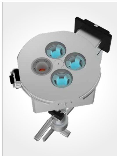
Preparation of Dosimetry and cell culture