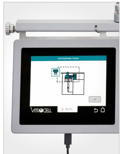
Step by step guidance by PowderX