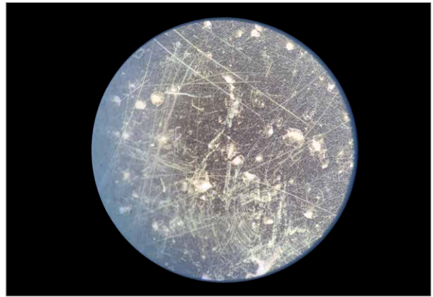
Stabilized layer of \text{TiO}_2 particles on the gold surface of sQCM 12.

After one-time calibration to a reference method (e.g. gravimetric), this subsequently allows for easy and convenient dosimetry of the deposited powder directly within PowderX.