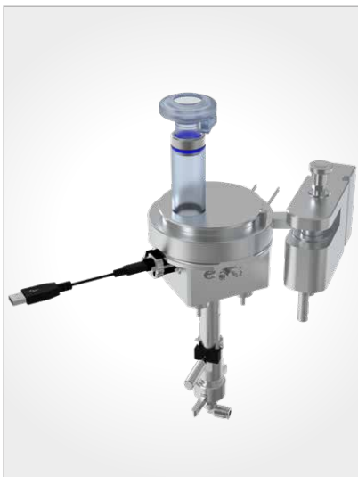
VITROCELL® DryPowder Kit for PowderX

The PowderX control software provides step-by-step guidance for the post-processing procedure, minimizing errors and ensuring ease of use.