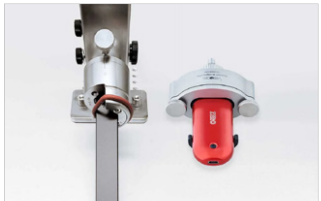
Option: for any puff-actuated device