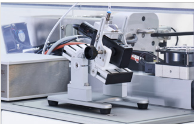
Option: for button actuated e-cigarettes