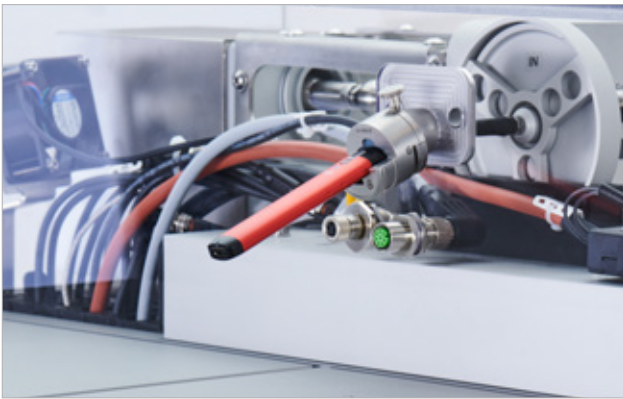
Option: for draw actuated e-cigarettes