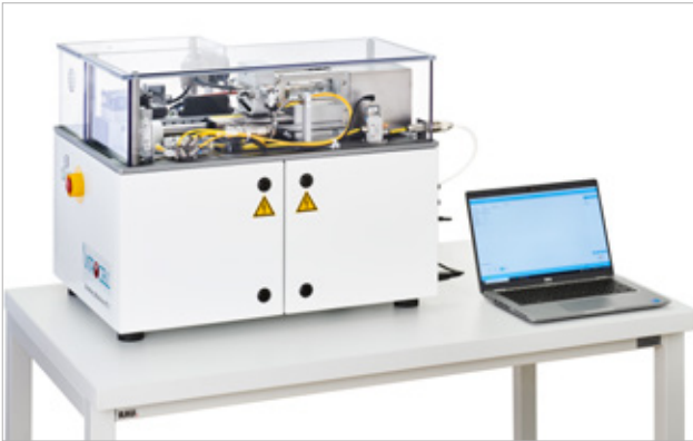
VITROCELL® Smoking Machine VC 1 Standard version