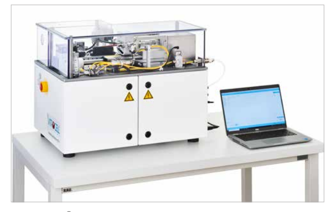
VITROCELL® Smoking Machine VC 1 Standard version