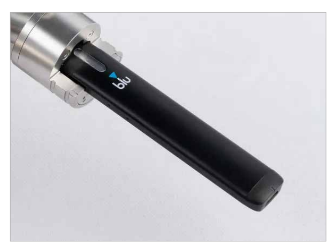
Option: holder system for ENDS products (e.g. blu)