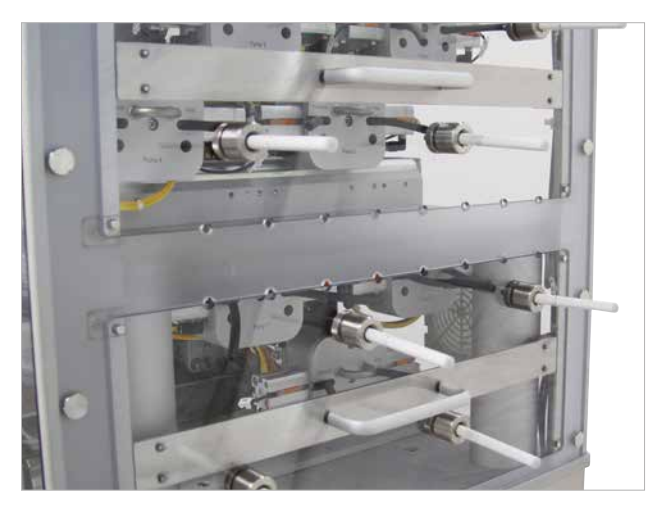
Mode 1: draw actuated cigarettes