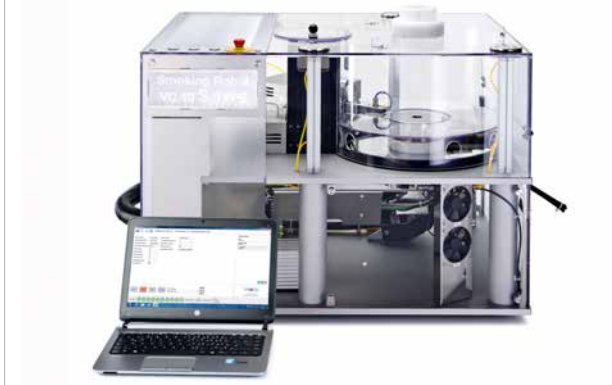
VITROCELL® Smoking Robot VC 10 S-Type Standard version