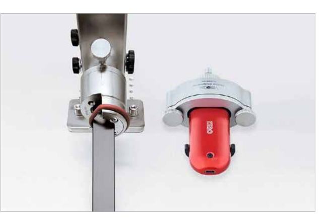
Option: for any puff-actuated device