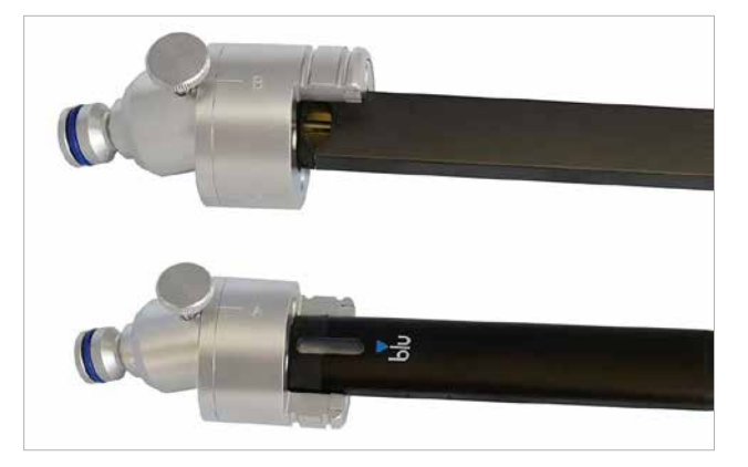
Option: holder system for ENDS products (e.g. blu)