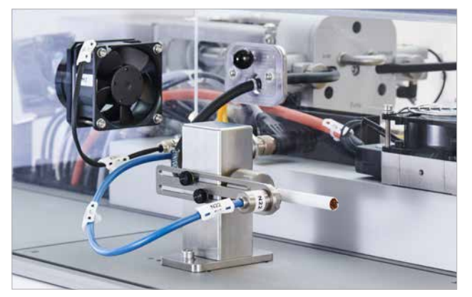
Standard: for Conventional Cigarettes