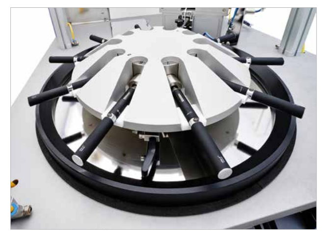
Option: holder for ENDS products