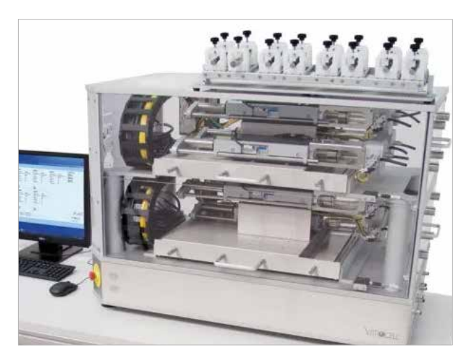
Mode 2: vapestarters with button activatros for tank products