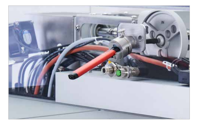
Option: for draw actuated e-cigarettes