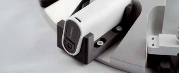
Option: quick-lock holder for HTP products