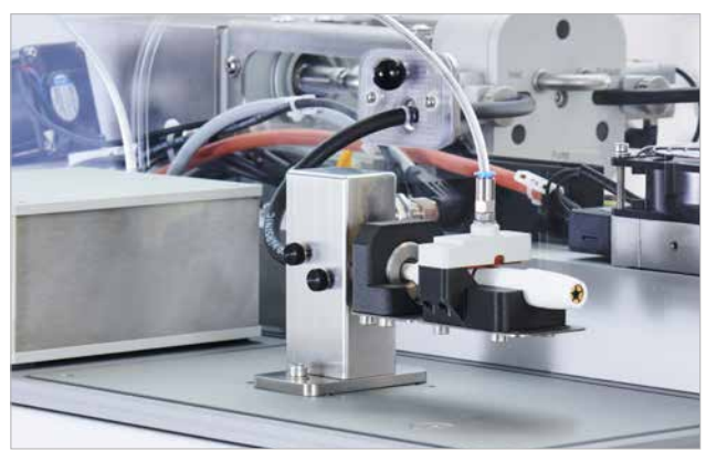
Option: for Heated Tobacco Products (HTP)