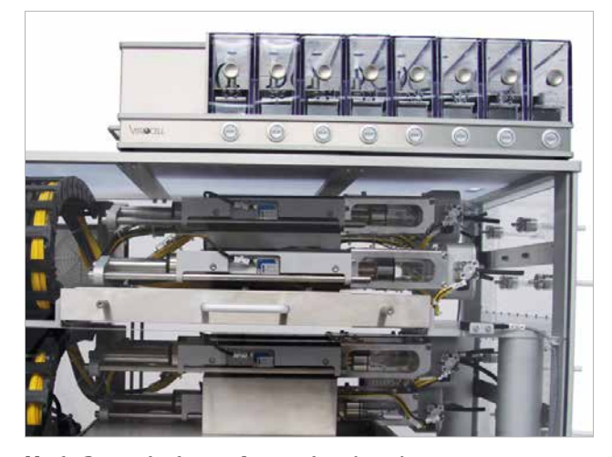
Mode 3: smoke boxes for combustion cigarettes