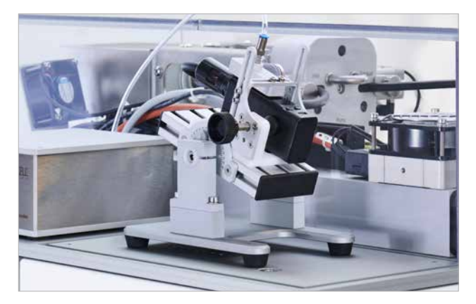
Option: for button actuated e-cigarettes