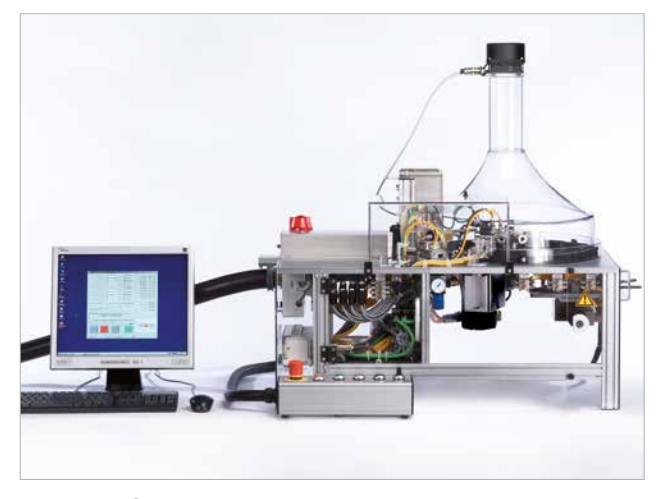
VITROCELL® Smoking Robot VC 10 standard version