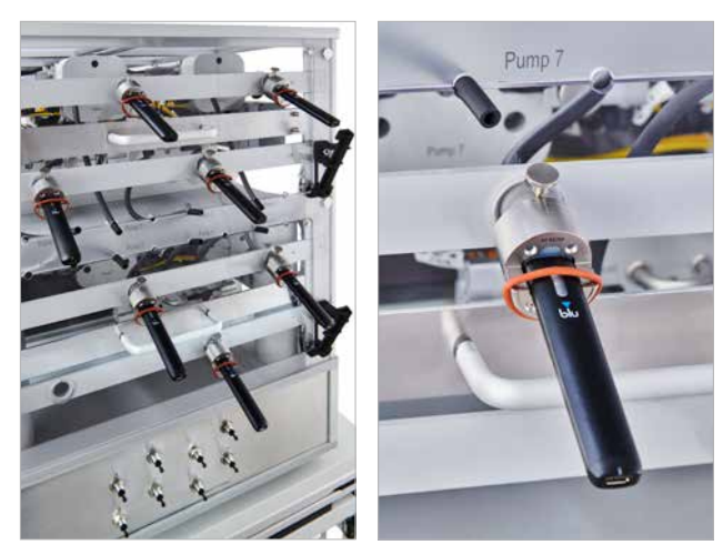
Holder system for ENDS products (e.g. blu)