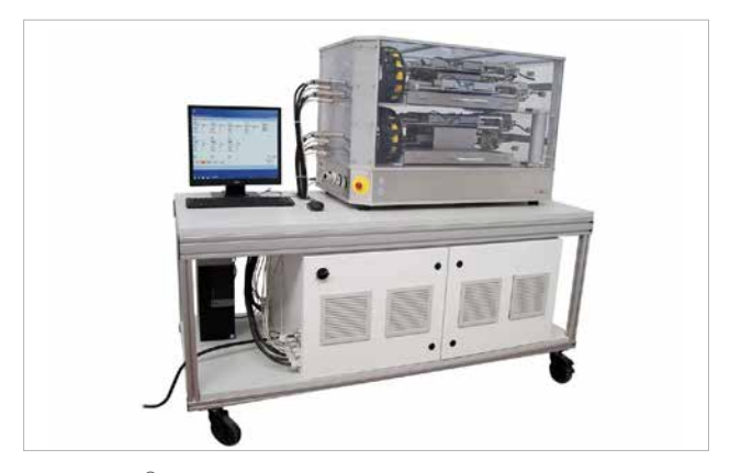
VITROCELL<sup>®</sup> Smoking Machine VC 1/7 standard version