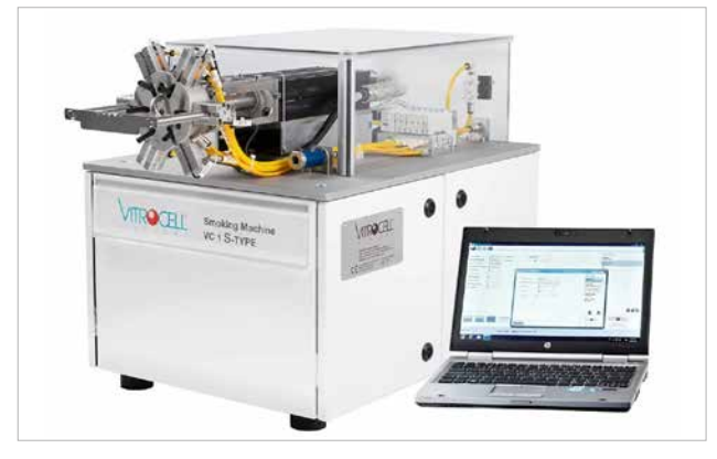
VITROCELL® Smoking Machine VC 1 S-Type standard version