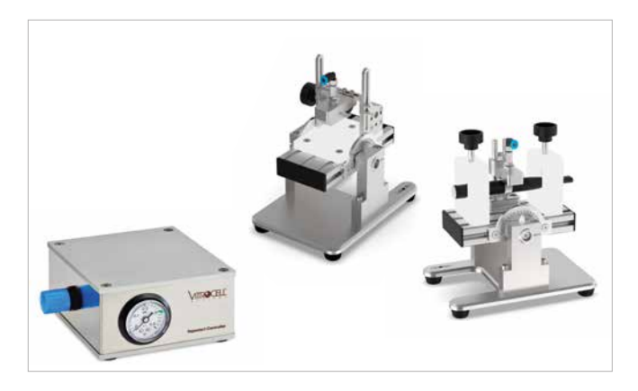
The system consists of Vapestart Controller, e-cigarette holder and different Vapestarter units.

For HTP devices, VITROCELL<sup>®</sup> Smoking Machines feature a specialized HTP trigger function. The Vapestarter unit can also be tailored to fit various tank products with different diameters and unique shapes.