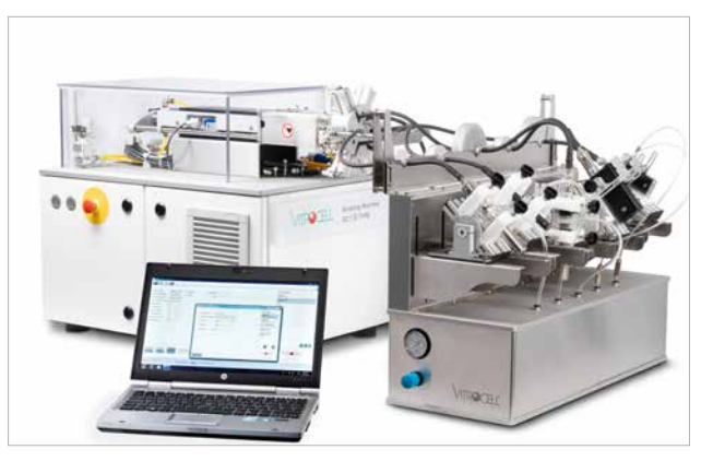
Option: for ENDS products (e.g. button or draw actuated and tank products)