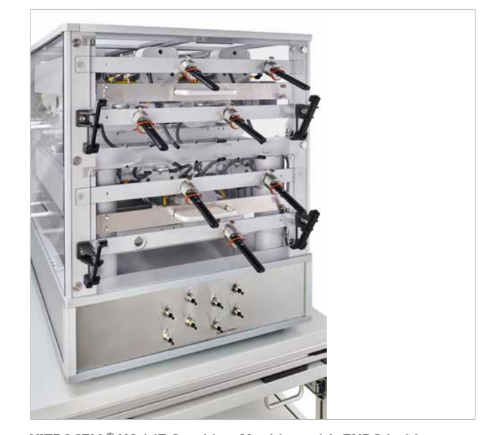
VITROCELL® VC 1/7 Smoking Machine with ENDS holders

Our holders are designed to seal airtight are robustly constructed, durable, and easy to clean. They are compatible with all VITROCELL® Smoking Machines and Robots. In most cases, simply exchanging the inner seal is enough to accommodate specific shapes.