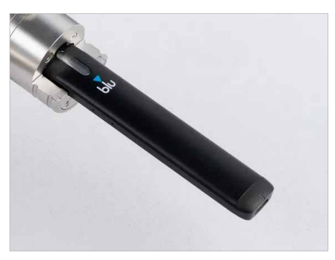
Option: holder system for ENDS products (e.g. blu)